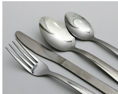
After using SMARTPOWER™ Presoak.