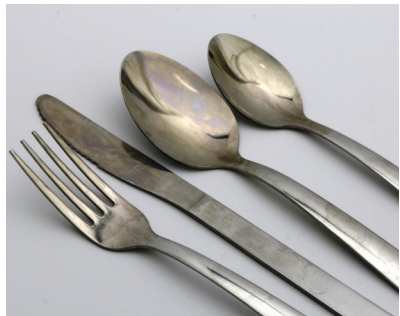
Before using SMARTPOWER™ Presoak.