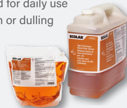
6100036 2.5 gal 6100035 2-2 L