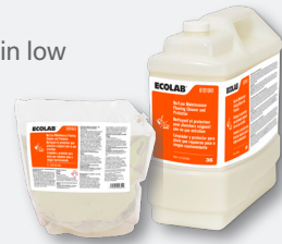
6101941 2.5 gal 6100943 2-2 L

Luxury vinyl tile (LVT) Rubber Laminate Linoleum Sheet vinyl