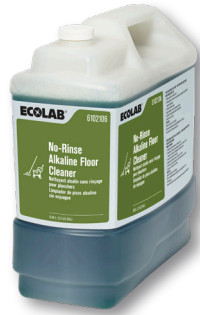
6102716 2.5 gal