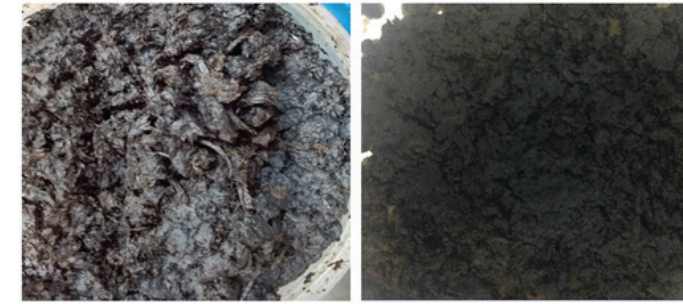
Figure 3. Blown Pulp Prior to Trial and During Trial